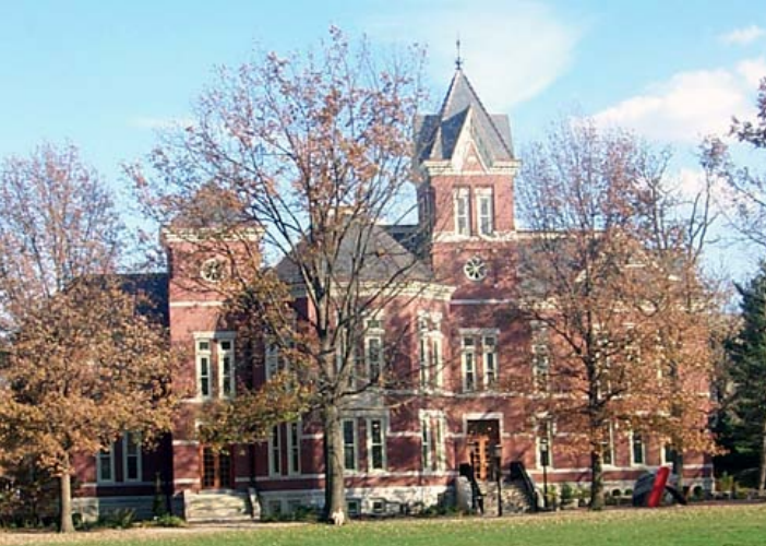
The Museum of Art and Archaeology is located in Pickard Hall on historic Francis Quadrangle, at the corner of University Avenue and South Ninth Street, on the University of Missouri-Columbia campus.

From the outside, Pickard Hall is one of the many majestic buildings on MU's historic Francis Quadrangle.