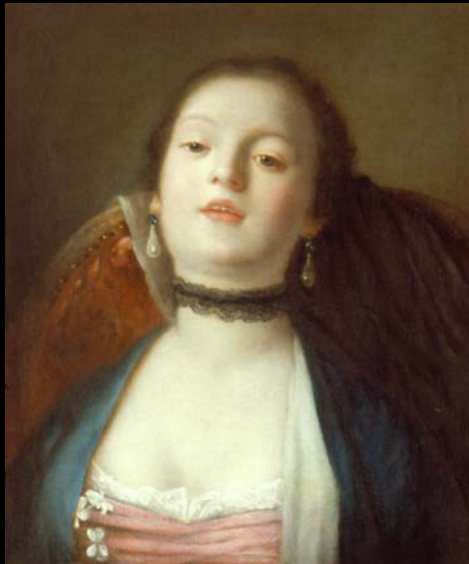
Pietro Rotari (Verona, 1707–1762) Portrait of a Young Woman Ca. 1760 Oil on canvas (61.82) Gift of the Samuel H. Kress Foundation