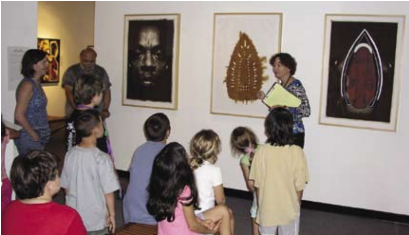
"Masks in the Museum" for a School's Out! Art's In! program