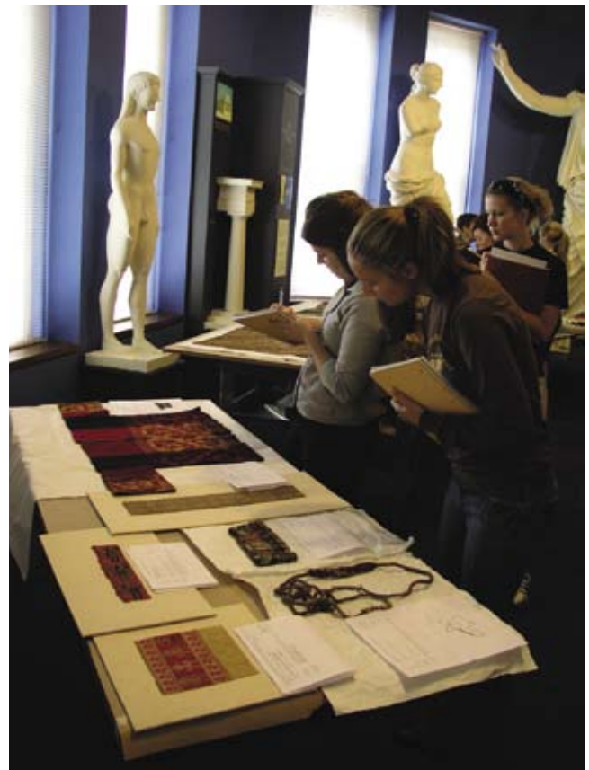
A display of pre-Columbian textiles for students in the Department of Textile and Apparel Management

A wide variety of outreach activities are also available to the Academic Coordinator, such as the MU Academic Transformations Symposium and orientation activities for MU Black and Gold days this October. Nearly fifty new MU faculty members heard a presentation about the Museum as a teaching resource, and several of them followed up with inquiries and class visits to the Museum. In November, seventy-five participants in the School of Medicine's STEP program were welcomed to the Museum. Beyond the walls of MU connections have been made with the Columbia Chamber of Commerce Education Committee, Boonville Rotary Club, The Missourian , and the Columbia Art League.