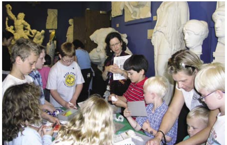
"Mummy is the Word" for a School's Out! Art's In! program

Volunteers are the heart of the Museum's success with community outreach. As the Halloween event exemplifies, from the docents to workers in the