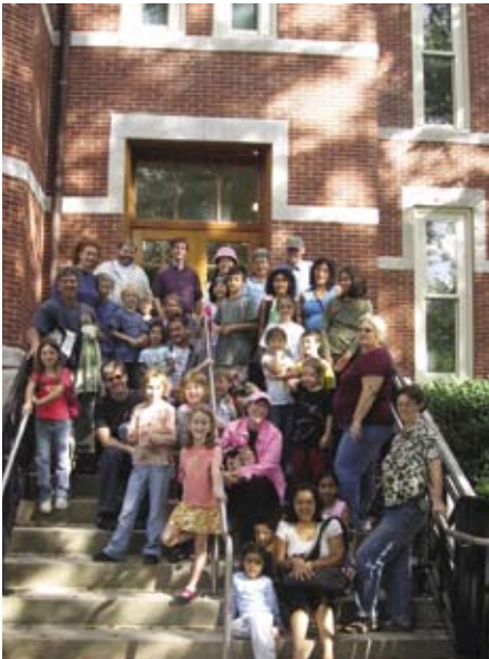
Lee Elementary visitors for the Museum's "Lights on Afterschool" program

Museum Store, we rely on your help! Let me know if you are interested in becoming a volunteer: you can do any of the above, as well as help with the Children's programming. Nothing is more rewarding.