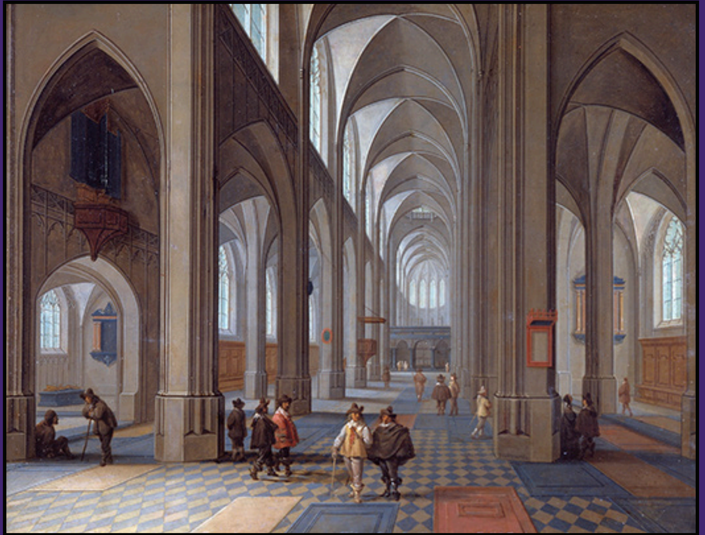
Peeter Neeffs the Elder (Flemish ca. 1578–1656/1661) Interior of a Gothic Church , ca. 1620 Oil on copper Gift of Museum Associates (78.25)

Another architectural work, Interior of a Gothic Church by Peeter Neeffs, can be found on display in the Museum galleries.