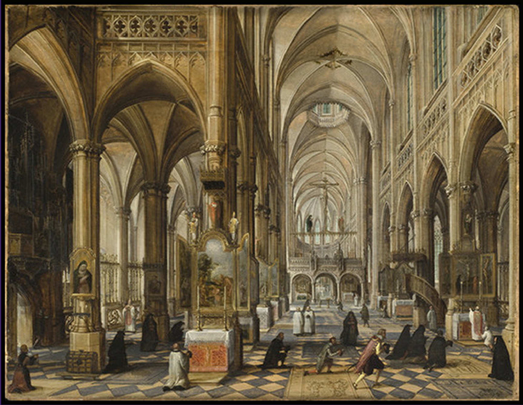
Paul Vredeman de Vries, Interior of a Gothic Cathedral , 1612 Los Angeles County Museum of Art