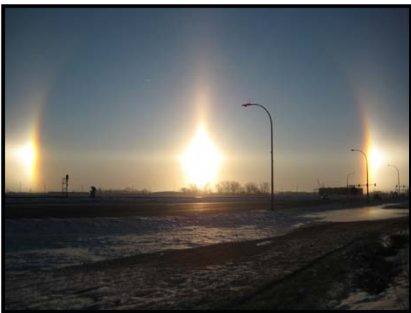
Example of a “sun dog”