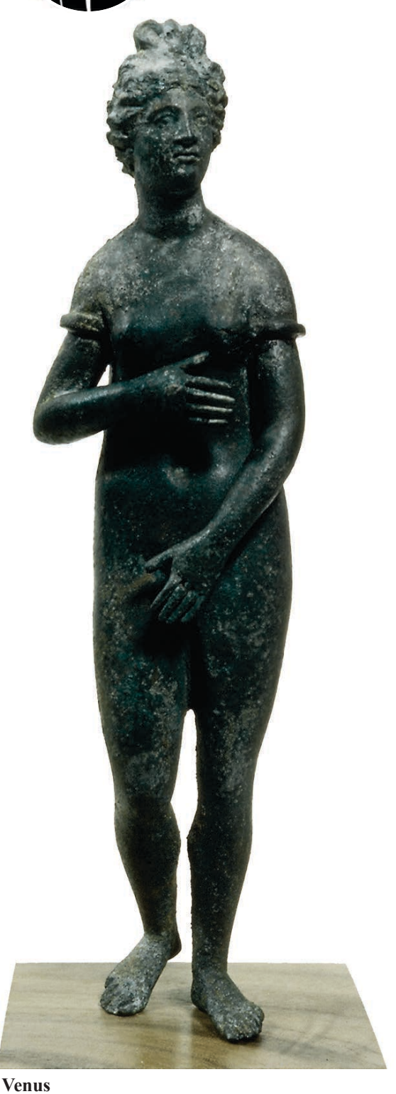
Roman, 2<sup>nd</sup> century CE Bronze Chorn Memorial Fund (61.25)