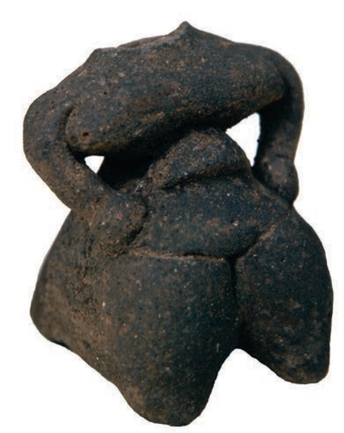
Seated Woman Greek, Neolithic, 6<sup>th</sup> millennium BCE From Thessaly (Greece) Terracotta Museum Purchase (66.343)

representations of pregnancies. Similar images continued to be produced for millennia, and the Museum's Neolithic example may date some 20,000 years after the earliest ones. Scholars rightly point out, however, that these are merely figurines, and there is absolutely no evidence that they represent a Great Motle certain: the figurines are extant, they represent