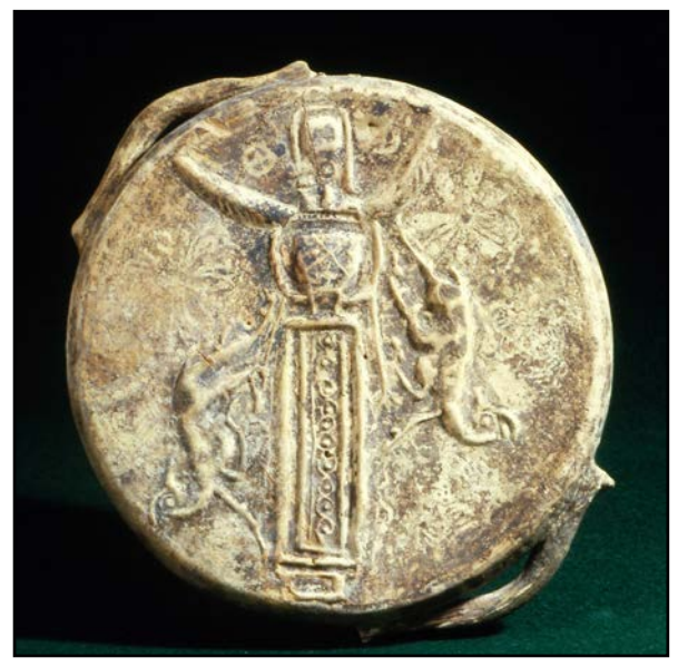
Plate with "Mistress of Wild Animals" Greek, Late Geometric, ca. 750 BCE Pottery Museum Purchase (73.212)

Most of the goddesses of the Graeco-Roman pantheon were mothers, except a few who remained virgins. A "great mother" above all, however, was worshiped in various guises, most commonly by Greeks as Ge/Gaia or Cybele, the latter as "Magna Mater" by the Romans. Ge/Gaia is simply the Greek word for "earth," and the personified