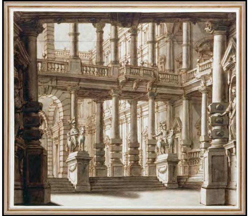
Antonio Galli Bibiena (Italian, 1700-1774) Stage Design: Interior of a Courtyard with Equestrian Statues and Columns Pen and ink, blue and gray washes Museum purchase (76.74)

architectural sense and would have no clear function. Like the fanciful frescoes of ancient Rome, Joli gives us an architectural confection that can exist only in the realm of fantasy. Joli's contemporary, Antonio Bibiena, produced similar architectural works. But despite the title assigned to his sketch in the Museum's collection, it remains unclear what it represents (a stage set?) or whether it was ever constructed in reality. By the nineteenth century, recreating the classical past had reached its climax. Painters, sculptors, and architects doggedly continued their romantic visions of it. Generic ruins, which did not represent known sites, abounded everywhere, from wallpaper to jewelry to textiles. Some even rose anew on the grounds of grand estates. The Museum's tortoise shell keepsake box is but one example in an astonishing variety of mediums that featured nostalgic, historical fantasies.