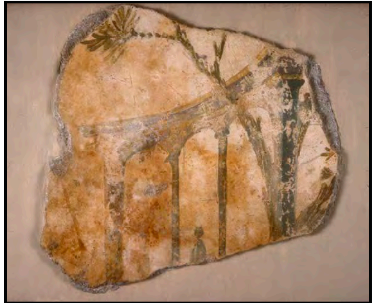
Fresco Fragment Depicting an Outdoor Arcade Roman, late 1 st century BCE–early 1 st century CE Probably from Italy Painted plaster Anonymous gift (80.194)

Art is the perfect vehicle for imagination, and artists have ceaselessly let theirs run free throughout this vast and varied material legacy. Imagining the past, future, or alternative versions of the present has preoccupied the artistic mind for millennia. For example, ancient Roman villas had few windows that looked out onto the city since streets were notoriously noisy, dirty, and stinking. Instead, interior walls were decorated with colorful frescoes that cleverly gave the illusion of idyllic vistas just beyond the house. Landscapes, seascapes, and tableaux of Greek mythology artfully extended space as if one were peering through windows into misty panoramas or the imaginary past. As time progressed, the scenes became more fantastic. A preference for spindly, sham “architecture” that defies logic and function became the fashion. Such frescoes would have a profound influence on posterity, particularly from the Renaissance onward, when many were being unearthed. Italian Renaissance artists clearly thought a lot about their ancient forbearers, but knowledge of specifics could be lacking. Ottoman-held Greece was closed to Western travelers, and the jumble of Greek, Etruscan, and Roman remains in Italy must have been puzzling. Nevertheless, the eager did not hesitate to recreate the ancient world, filling in