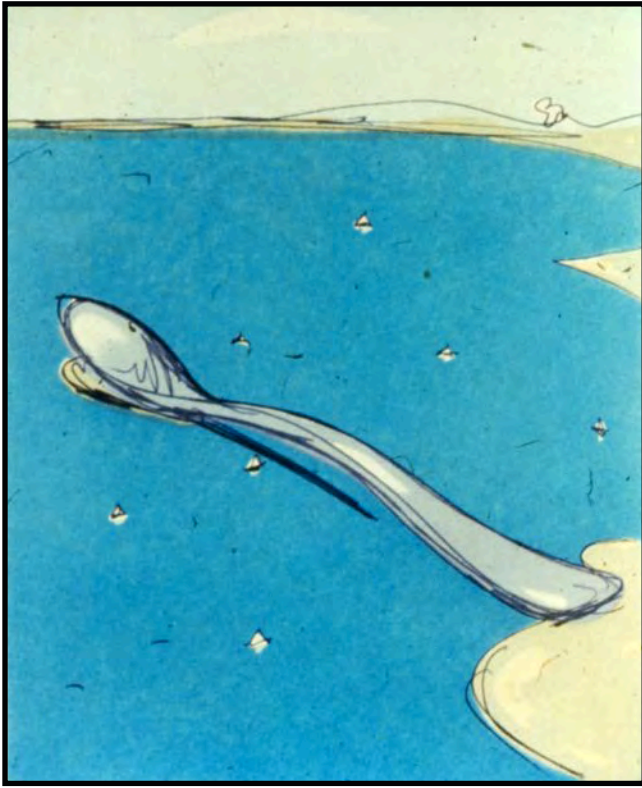
Claes Oldenburg (American, b. 1929) Spoon Pier , 1975 Color aquatint and etching Gift of Graduate Student Association (79.80)