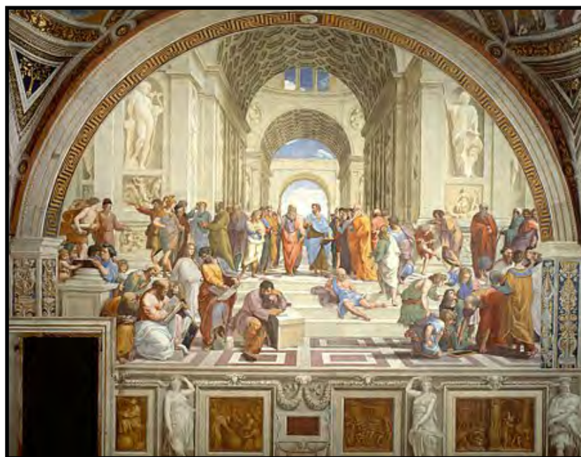
School of Athens, Stanza della Segnatura, Vatican, Rome

For centuries following the Renaissance, the obsession with recapturing classical antiquity would be as endless as the license taken with its details. The Modenese Antonio Joli was an acolyte of Giovanni Pannini (1691–1765) who was particularly known for his views of Italy’s antiquities. Joli followed suit but had a tendency to embellish and invent. The Architectural Capriccio attributed to Joli does not represent any known Roman ruin, and the grandiose courtyard makes little