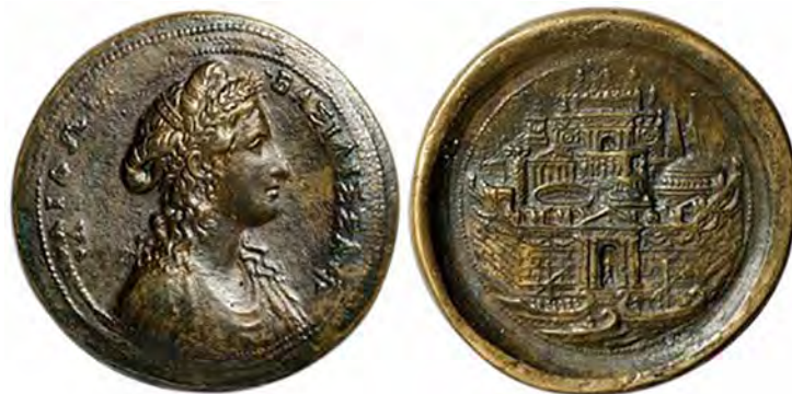
Alessandro Cesati, called “Il Grechetto” (Italian, ca. 1538–1564) Medallion with Queen Dido (obv) and View of Carthage (rev), ca. 1550 Bronze Museum purchase (66.341)