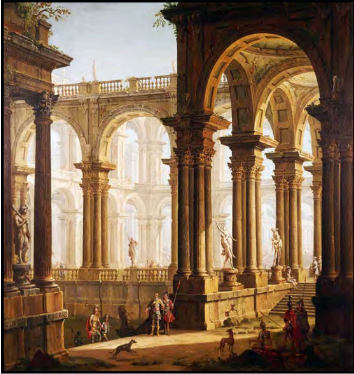
Attributed to Antonio Joli (Italian, 1700–1777) Architectural Capriccio , 18 th century Oil on canvas Museum purchase (72.59)