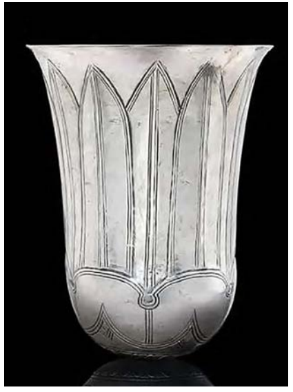
Egyptian Cup with Lotus Design Example from antiquities market. Authenticity not verified.

Museum Galleries have REOPENED Gallery Hours Monday - Friday: 9am to 4pm Saturday & Sunday: Noon to 4pm CLOSED Mondays