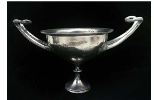
Kylix (drinking cup) Greek, Hellenistic, 3<sup>rd</sup>-2<sup>nd</sup> century BCE Silver Museum purchase (77.182)