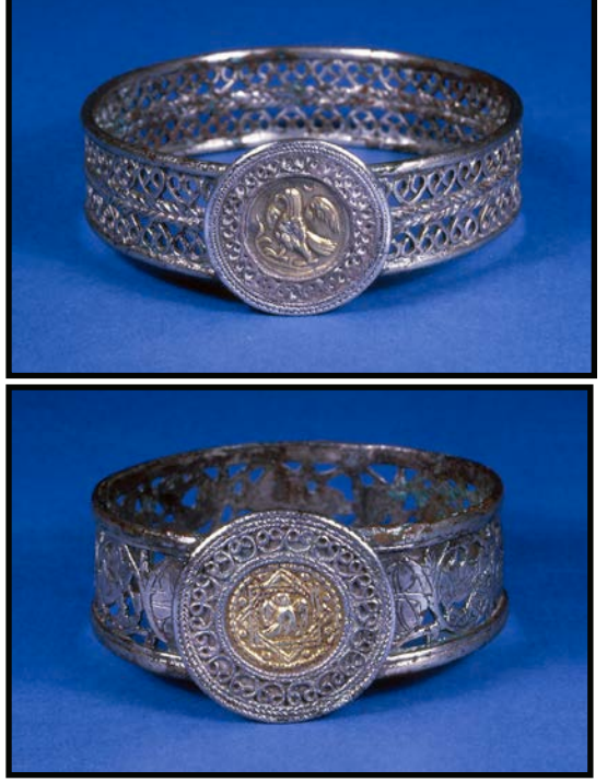
Bracelets with Medallions Byzantine, 5<sup>th</sup>–6<sup>th</sup> century CE From Palestine, near Hebron Silver with gilding Chorn Memorial Fund (68.175 a & b)