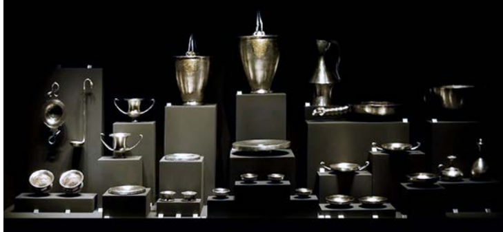
Silver Vessels from Royal Macedonian Tomb at Aigai

Athens was bankrolled by silver from the nearby Laurion Mines and the city allegedly had three metric tons (ca. 6,600 lbs) of silver at its disposal in the early fifth century BCE. While silver coinage continued to be manufactured, exquisite objects of silver also became commonplace among the wealthy. The Museum's elegant silver kylix and mastos may have been part of sets, which were certainly being created by the Hellenistic age, but probably earlier too. One astounding set of silver vessels from royal Macedonian tombs was discovered intact and is on display today in the Museum of the Royal Tombs of Aigai at Vergina (Greece). Romans followed suit, and many fabulous vessels are known from the Roman Empire, in addition to silver utensils, figurines, boxes, and furniture attachments. A number of famous Roman hoards* of silver have been discovered over time and can only hint at the wealth of some of the empire's elite. One of the Museum's more unusual objects is a Roman silver spoon inscribed with a dedication to the goddess Hekate from a walnut dealer called Eutyches. Roman silver spoons came in sets, and it is likely that Eutyches parted with one of his precious spoons for a specific reason related to the goddess. Unfortunately, the reason remains tantalizingly