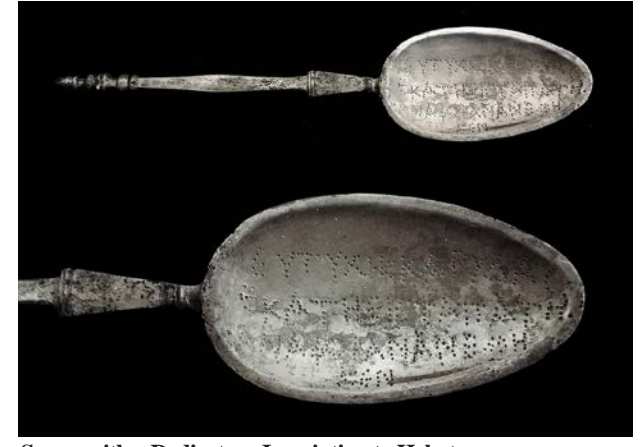
Spoon with a Dedicatory Inscription to Hekate Roman, 2<sup>nd</sup>-3<sup>rd</sup> century CE Silver Museum purchase (74.147) Inscription: " Eutyches, the walnut dealer, gave (this) as an offering to Hekate for the patē. " The meaning of "patē" in Greek remains unclear.