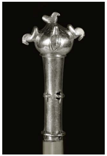
Finial with Bird and Horses Ca. 1550–1200 BCE From Palestine Silver Weinberg Fund (84.23)