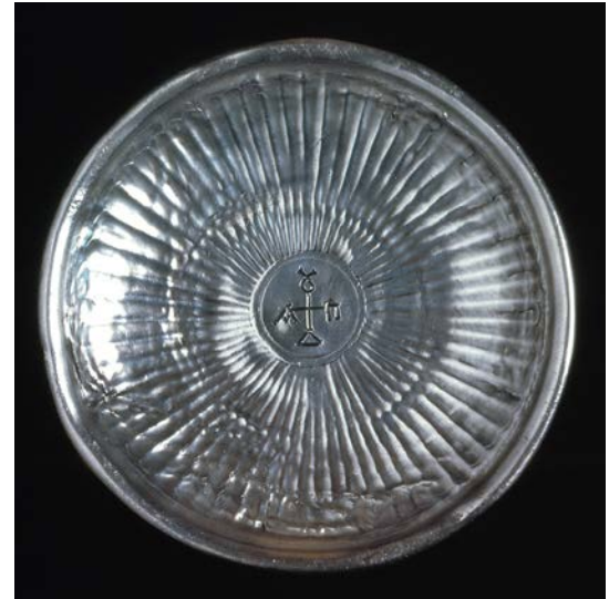
Dish with Monogram Byzantine, 6<sup>th</sup>-7<sup>th</sup> century CE From Palestine Silver and niello Weinberg Fund (84.56)

The most notable are: <u>Esquiline Treasure</u> <u>Berthouville Treasure</u> <u>Hildesheim Treasure</u> <u>Mildenhall Treasure</u> <u>Kaiseraugst Treasure</u>