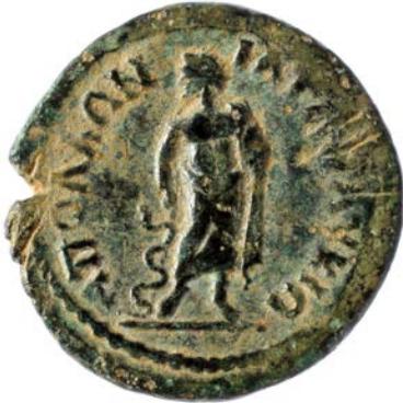
Coin of the Emperor Commodus with Asklepios (reverse) Roman, ca. 175 CE Mint of Apollonia/Sozopolis (Turkey) Bronze Museum purchase (72.193)