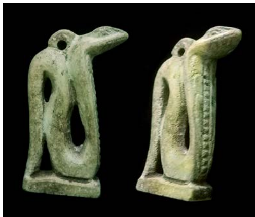
Pendant in the Form of a Cobra Egyptian, Late Period/Ptolemaic, 664–30 BCE Faience Museum purchase (72.17)

Snakes are rife in the lore of ancient Greece where they were frequently associated with Ge (Mother Earth) since they slithered along her surface and lived in burrows within her. Moreover, her offspring, such as