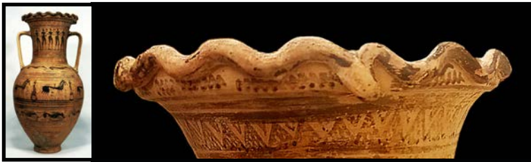
Neck-Handled Amphora (and rim detail) Greek, Geometric, ca. 720–700 BCE From Attica Pottery Museum purchase (58.3)

some of the legendary kings of Athens, were often part snake. The circumstances that led to the birth of King Erichthonius from the earth are detailed in the painting Athena Scorning the Advances of Hephaestus by Paris Bordone. Some ancient authors implied that snakes were spontaneously generated from beneath the earth, thus giving them chthonic or Underworld connections. It is therefore not surprising that they are commonly a feature of objects associated with death, such as one of the Museum’s cremation amphoras.