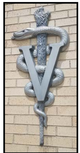
From MU School of Veterinary Medicine

One of the more recognizable snake symbols from ancient Greece belonged to the healer god, Asklepios, a son of Apollo. That symbol, a staff entwined with a single snake, is still used for medicine today. To ancient Greeks, the snake was a symbol of rejuvenation because it shed its skin. Additionally, because snakes are cold-blooded and need to absorb heat, it was thought that they might absorb fevers and infections if they came into contact with the sick. When one visited a sanctuary of Asklepios seeking a cure, it may be that the suppliant was compelled to spend time with the “sacred snakes” of Asklepios, before other treatments were administered. The “calling up” of the sacred snakes by a priest at healing sanctuaries seems to have been part of the ritual but it is unclear how the sick may have interacted with them. Nonetheless, ancient Greek and Roman objects such as jewelry often featured snakes, which probably functioned as talismans