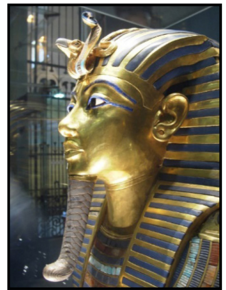
Mask of Tutankhamun