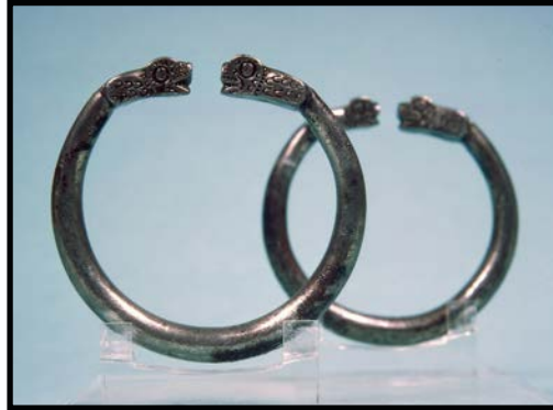
Bracelets with Snake-Head Terminals Greek, Late Archaic, ca. 500 BCE Silver and bronze Museum purchase (64.68.1 & 2)