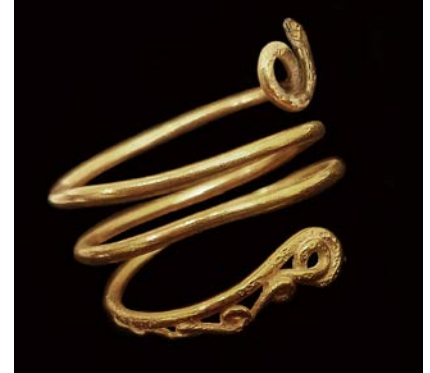
Finger Ring in the Form of a Snake Greek, Late Hellenistic, 150–50 BCE From Turkey Gold Weinberg Fund (85.46)