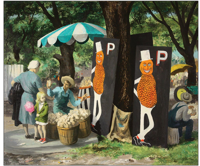
Lawrence Beall Smith (American, 1909–1995) Peanut Stand at the State Fair, Sedalia , 1946 Egg tempera on composition board (2014.102) Gift of Scruggs-Vandervoort-Barney, Inc.; transferred from the Office of the Vice Chancellor for Operations, MU

Nation collection is the only one that wasn't disassembled and scattered to the winds.