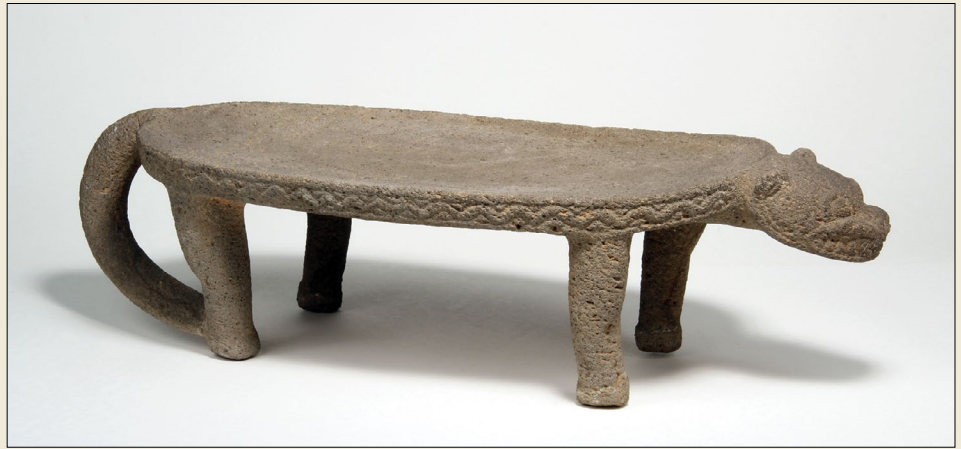
Metate in the form of a jaguar Pre-Columbian, Costa Rica Stone 800–1500 CE (2014.8) Gift of the Missouri State Museum