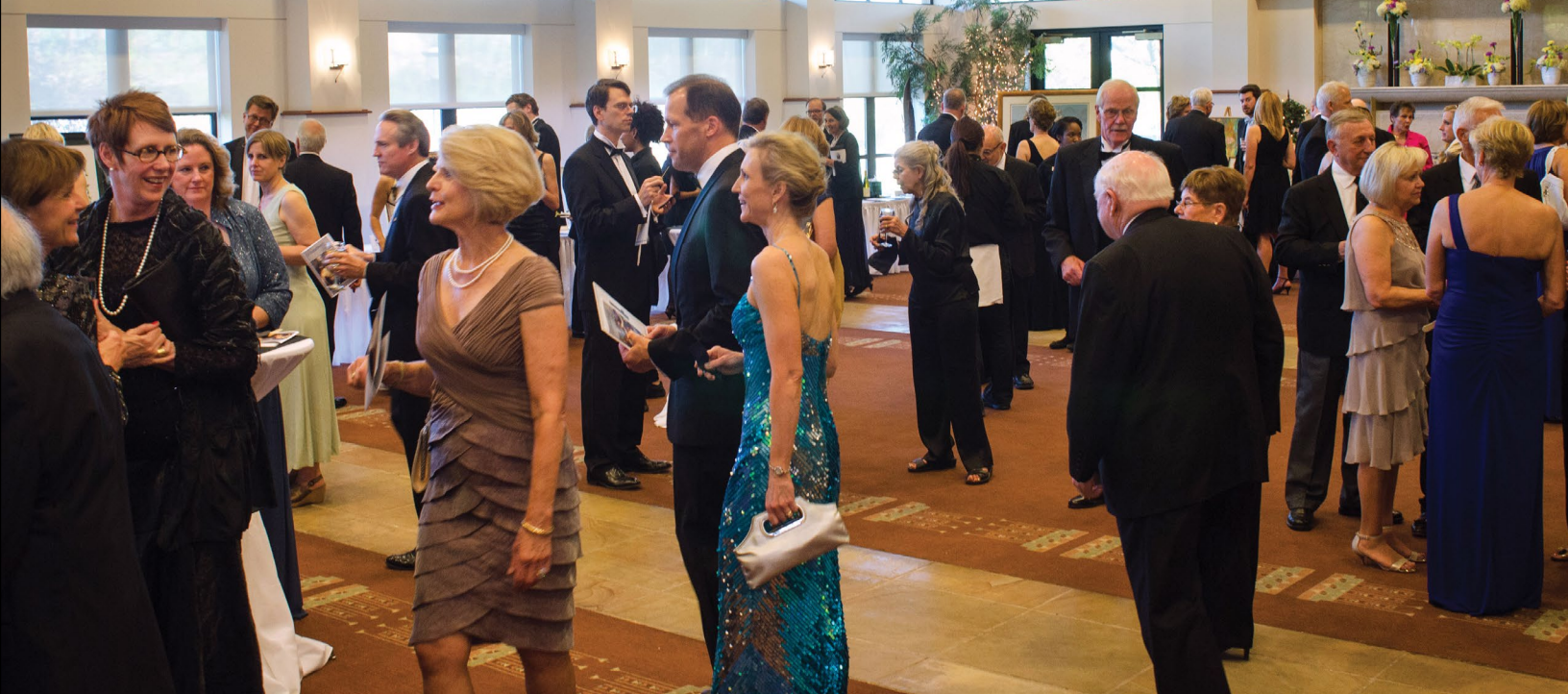
Guests mingle in the Great Room during the Paintbrush Ball's silent auction and cocktail hour.