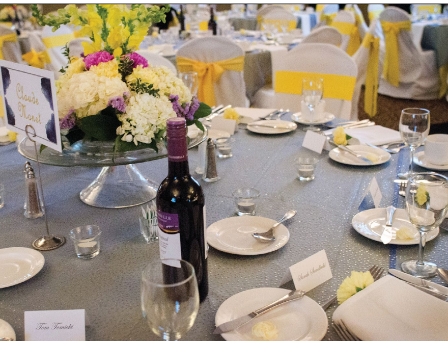
The 2014 Paintbrush Ball decorations provided by Patron Sponsor, Kent's on Broadway .

The upcoming year will be full of many firsts for the Museum at Mizzou North. The University Club has opened Café 115 at Mizzou North and visitors are welcome to enjoy lunch and pay a visit to both the Museum Store and Gallery of Greek and Roman Casts. We hope to see you at the Mizzou North Crawfish Boil in September. Keep your membership support coming and look forward to the galleries grand opening!