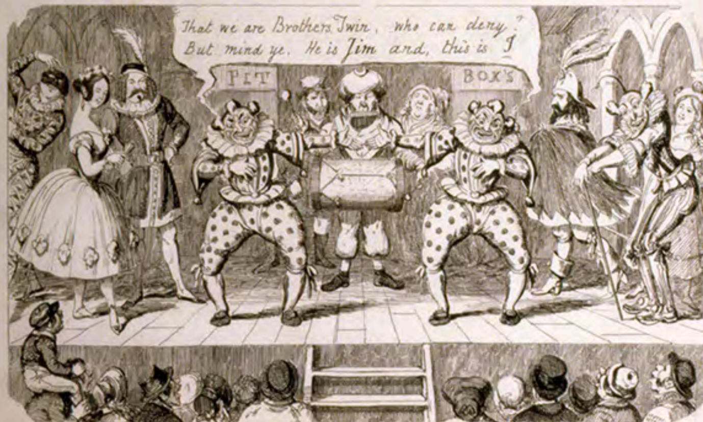
GEMINI — Odd-fellows.