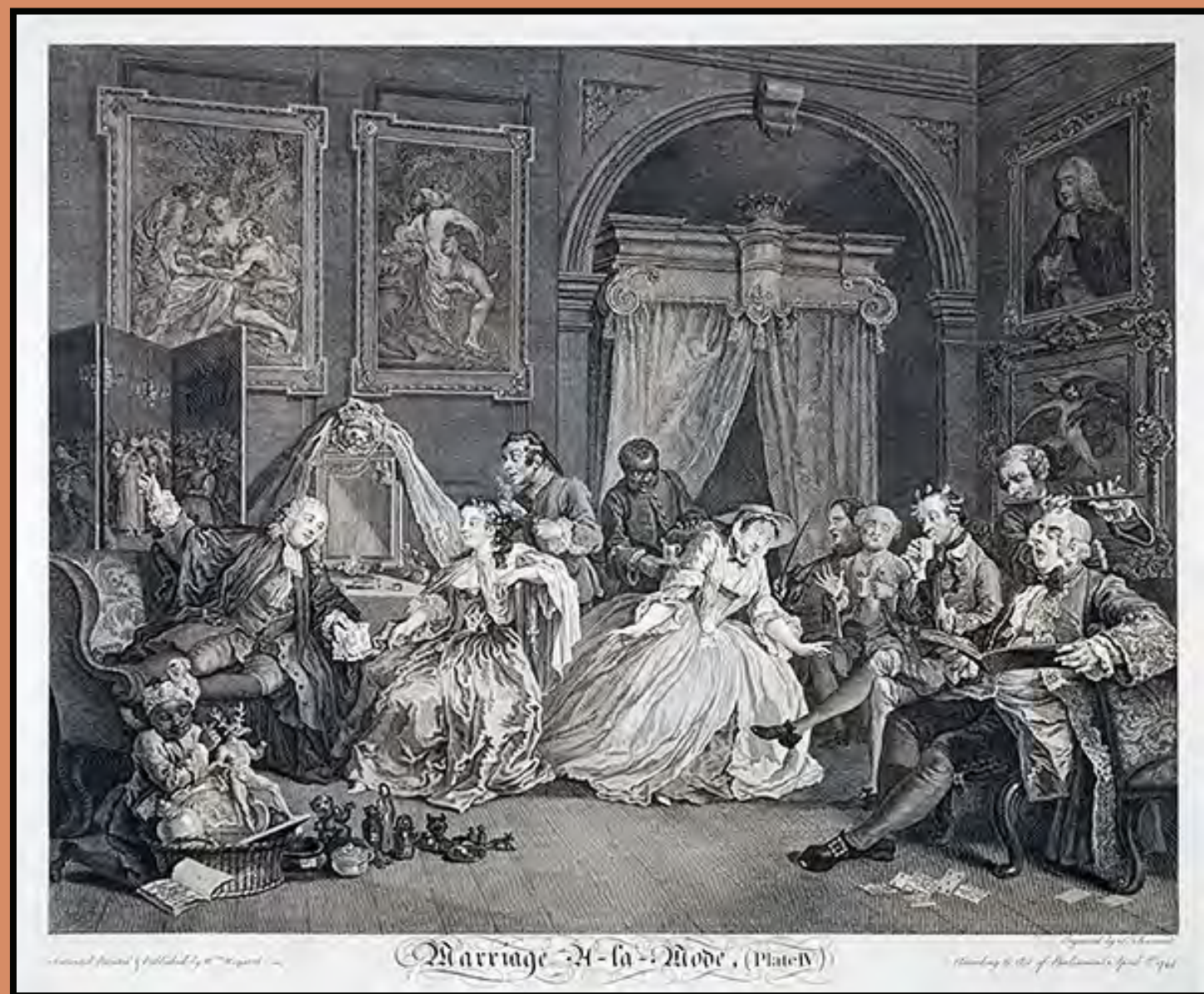
Plate IV: The Toilette (2008.16.4)