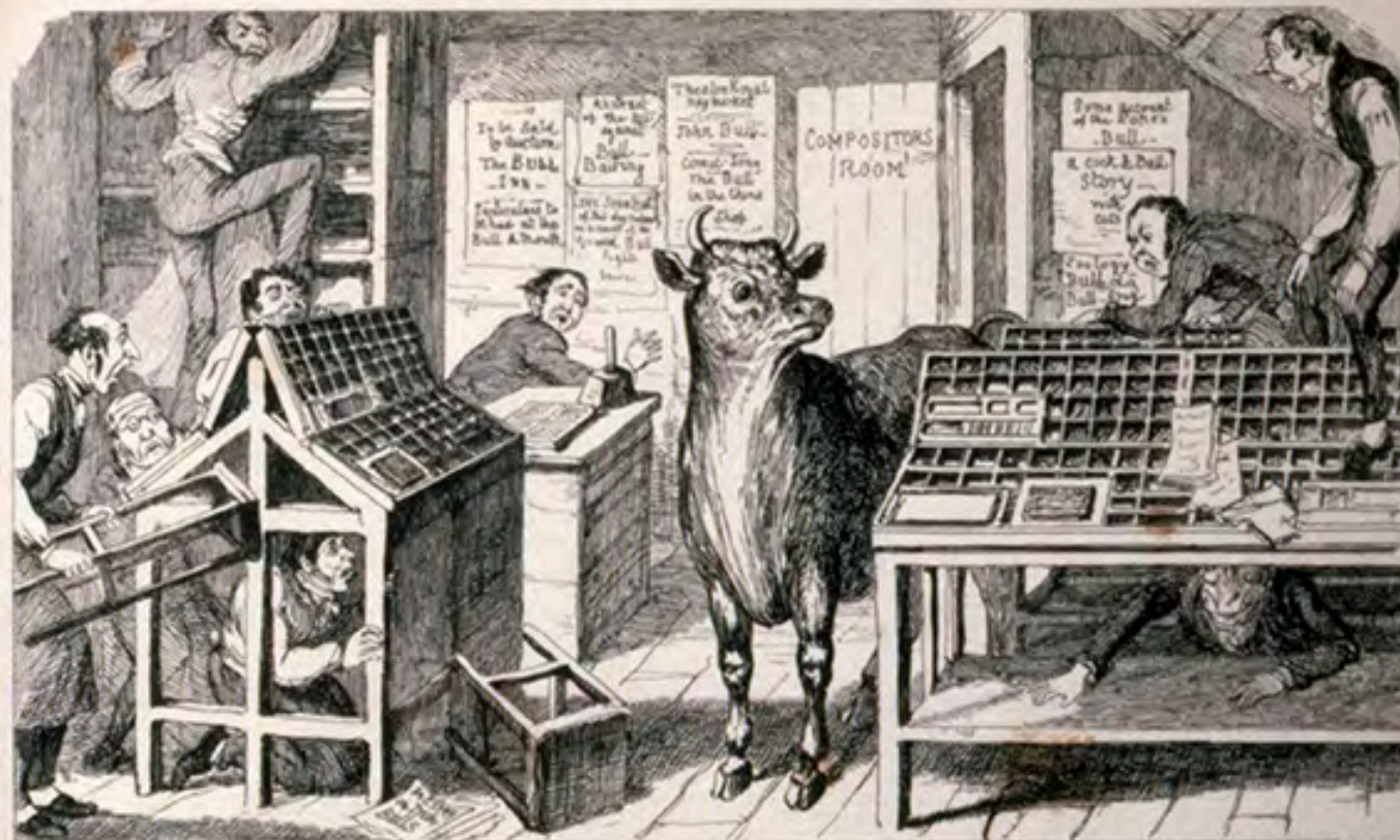
TAURUS — A literary Bull