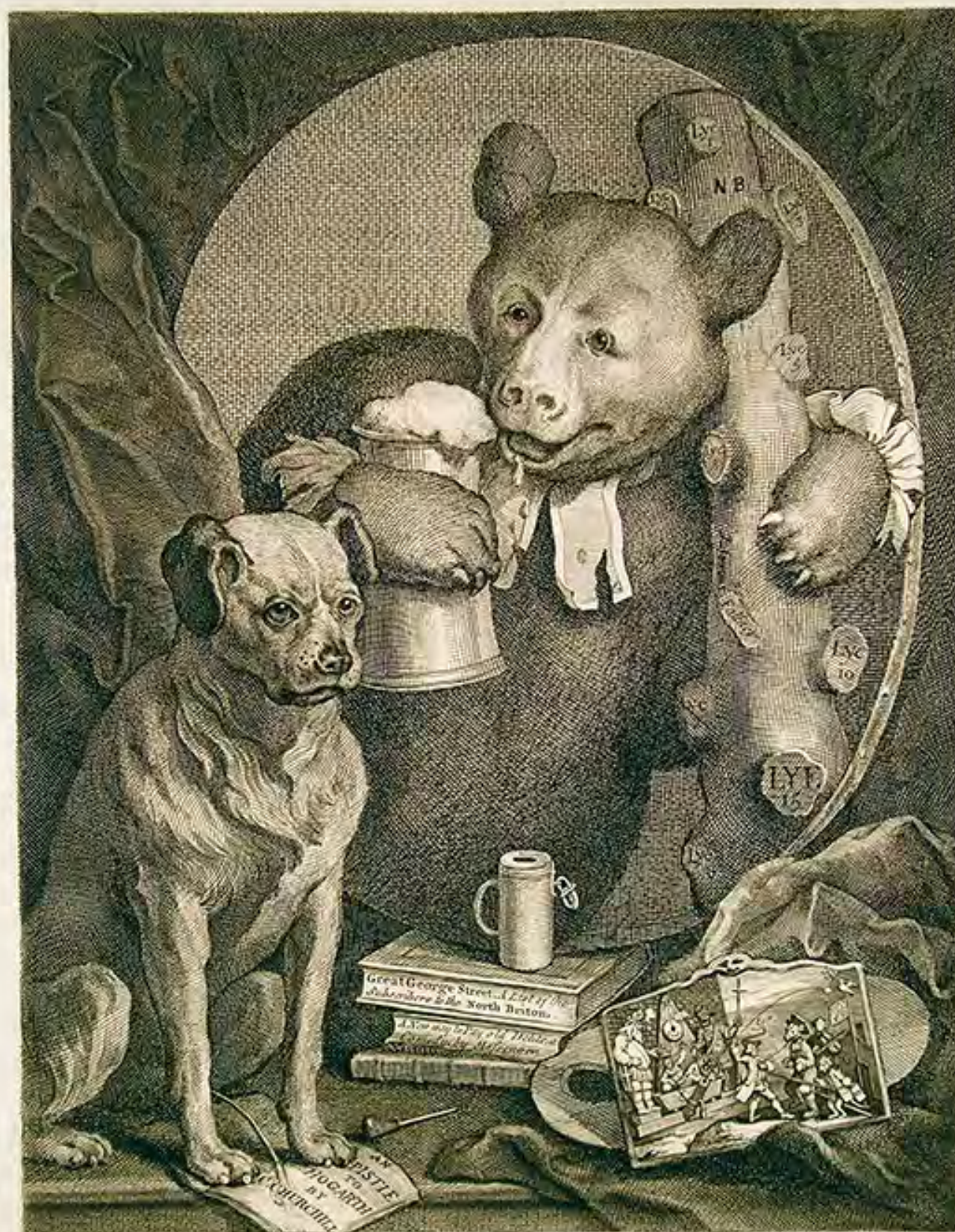
THE BRUISER. C. CHURCHILL (once the Rev.) in the Character of a Russian Hercules, Regaling himself after having killed the Monster Caricature that so long had his Victims from the Heaven-born WILKES — But he had a Club this Dragon to Drub. Or he had no'er don't I warrant ye. — Engraved by W. Hogarth. — Published by W. & A. Smith, 1763.