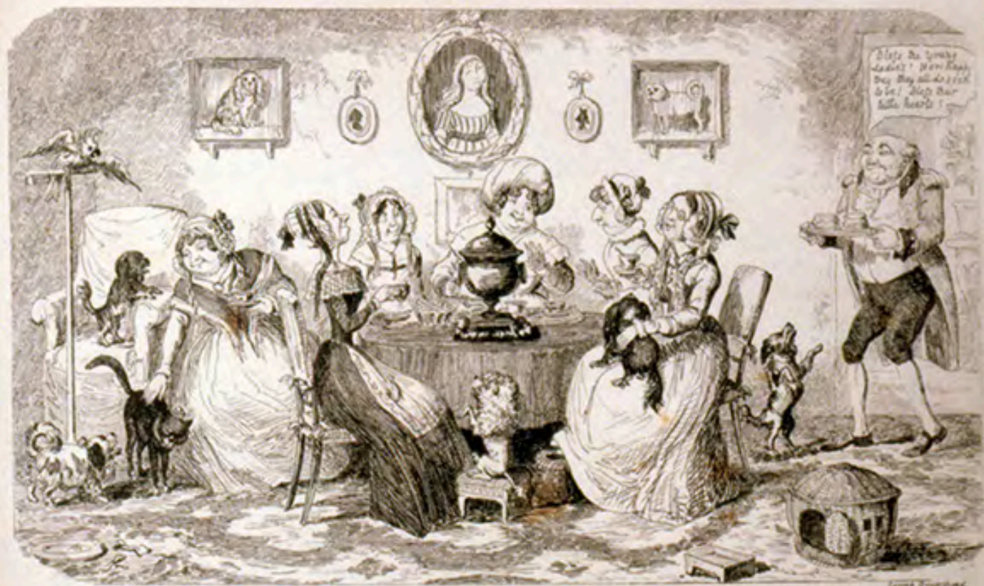
VIRGO — Unmatched enjoyment.