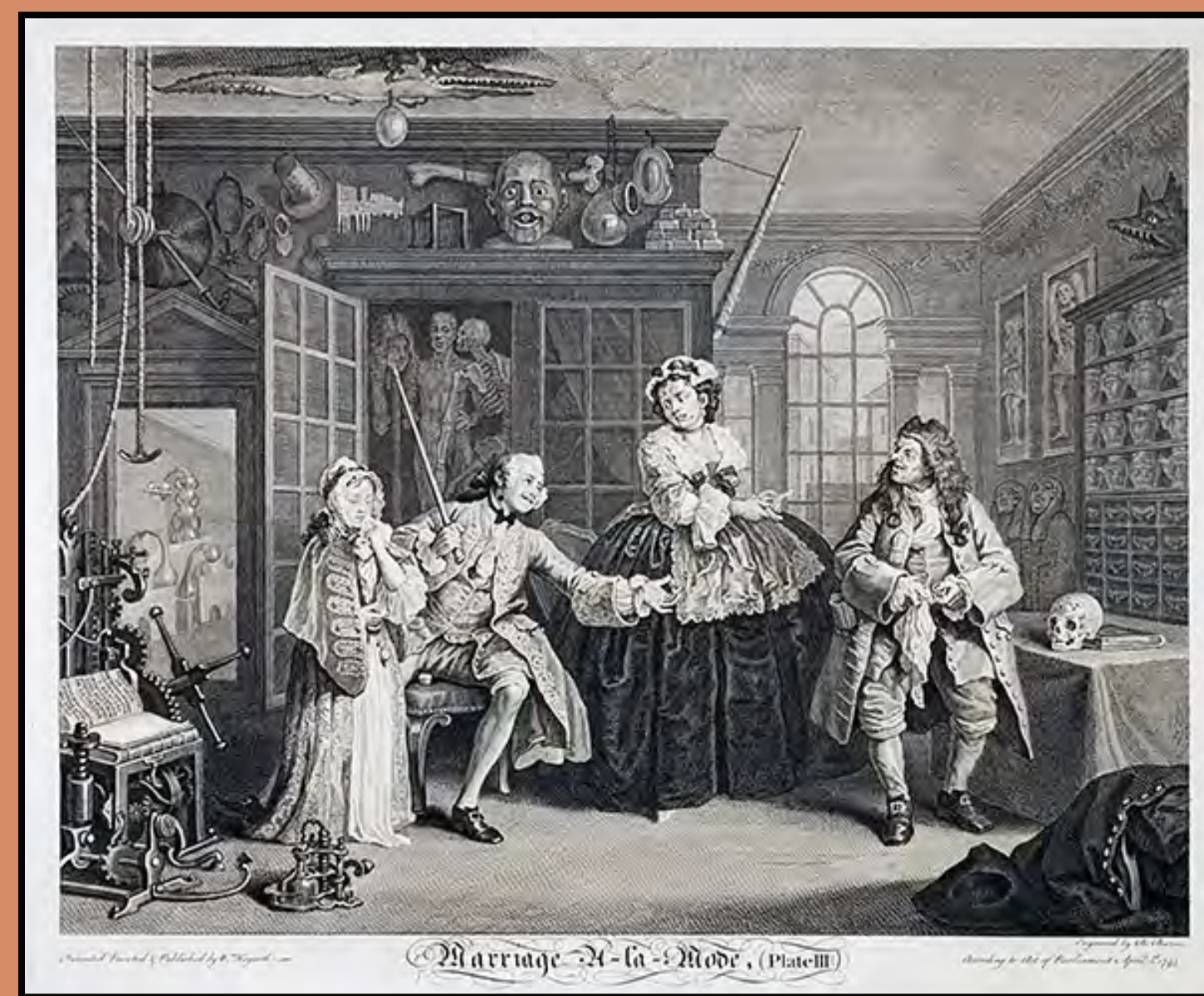
Plate III: The Inspection (2008.16.3)