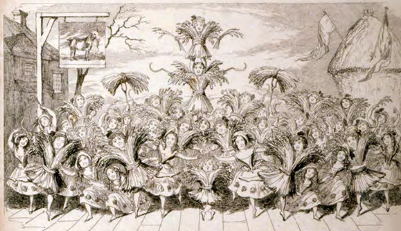
CAPRICORNUS — A Caper-o'-corns.