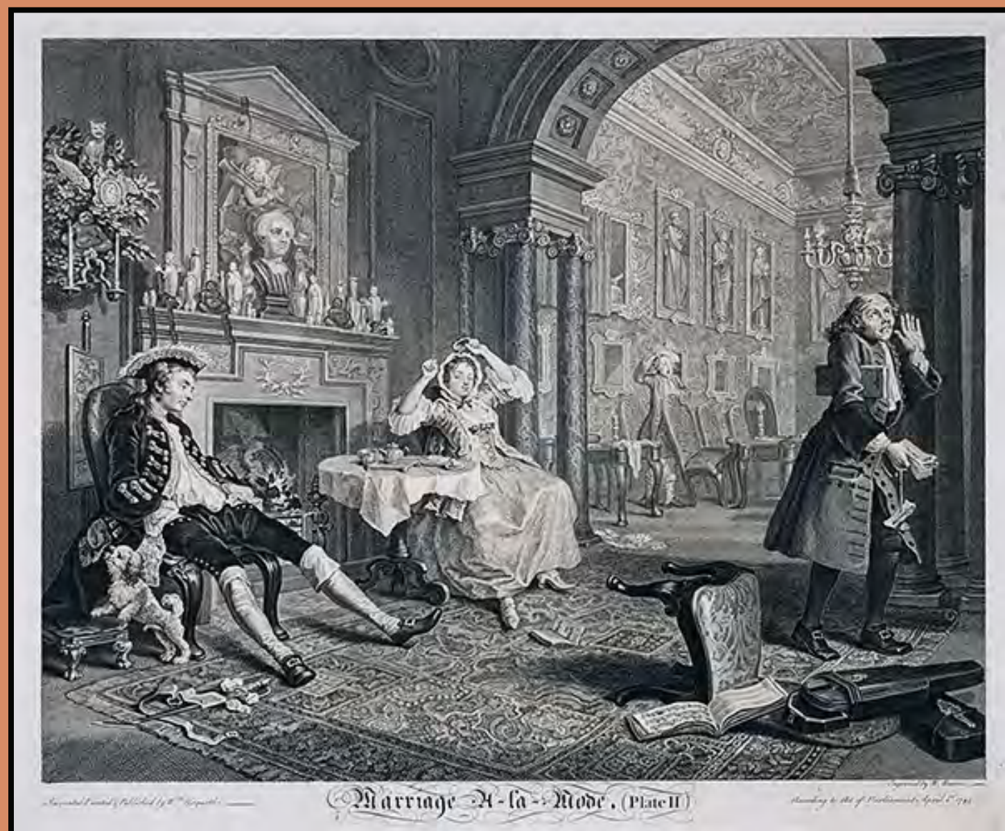
Plate II: The Tête-à-tête (2008.16.2)