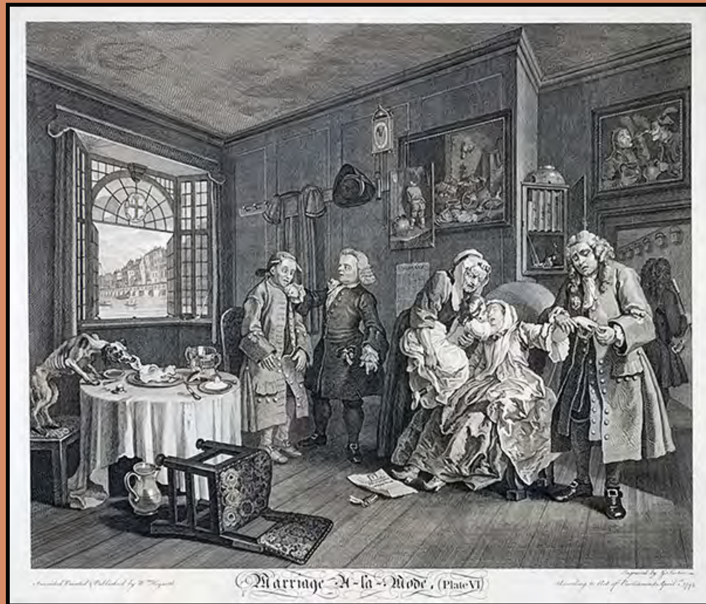
Plate VI: The Lady's Death (2008.16.6)

To view color images of the original oil paintings of Hogarth's Marriage à la Mode series as well as other Hogarth paintings, follow this link to the United Kingdom's National Gallery: