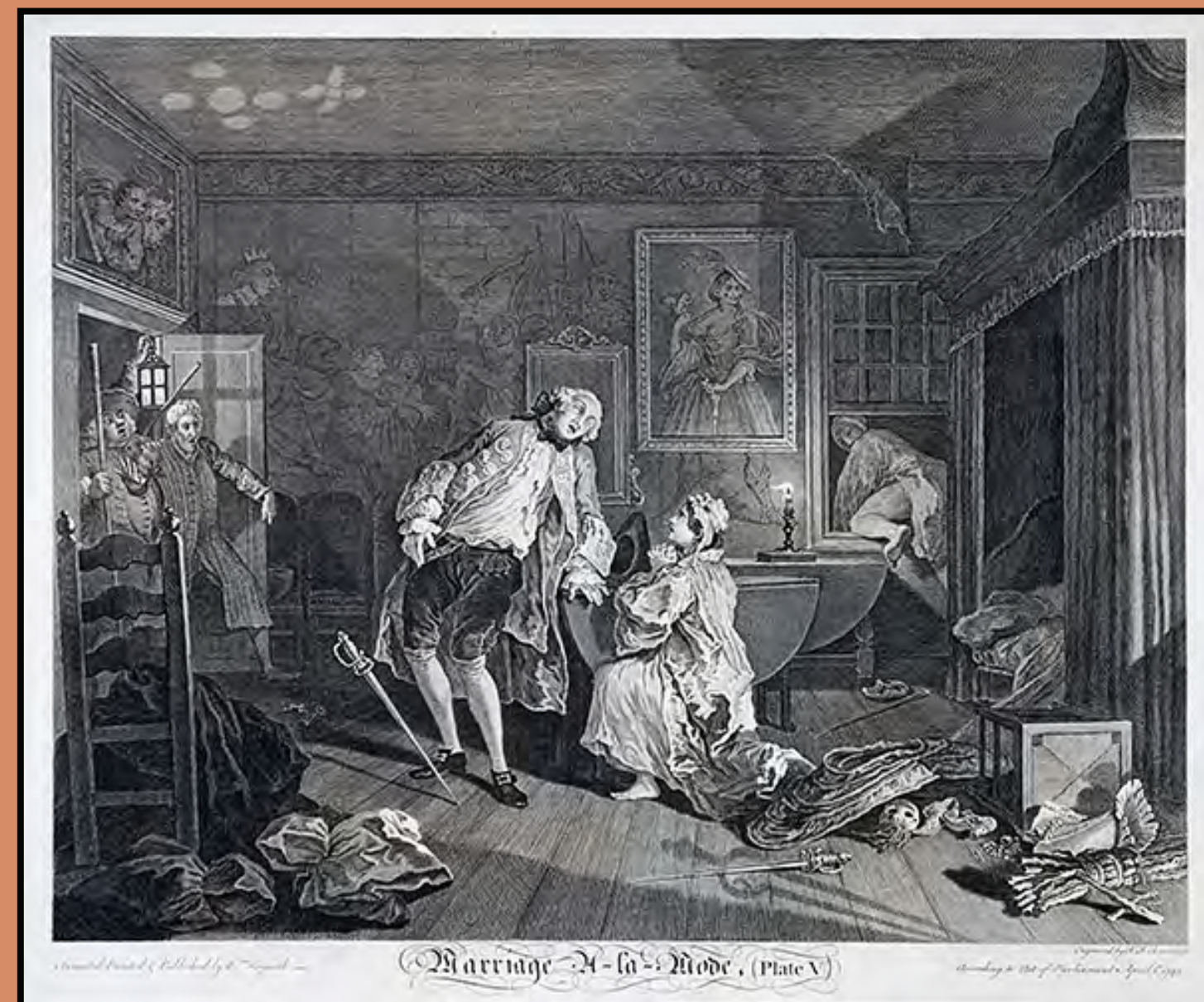
Plate V: The Bagnio (2008.16.5)