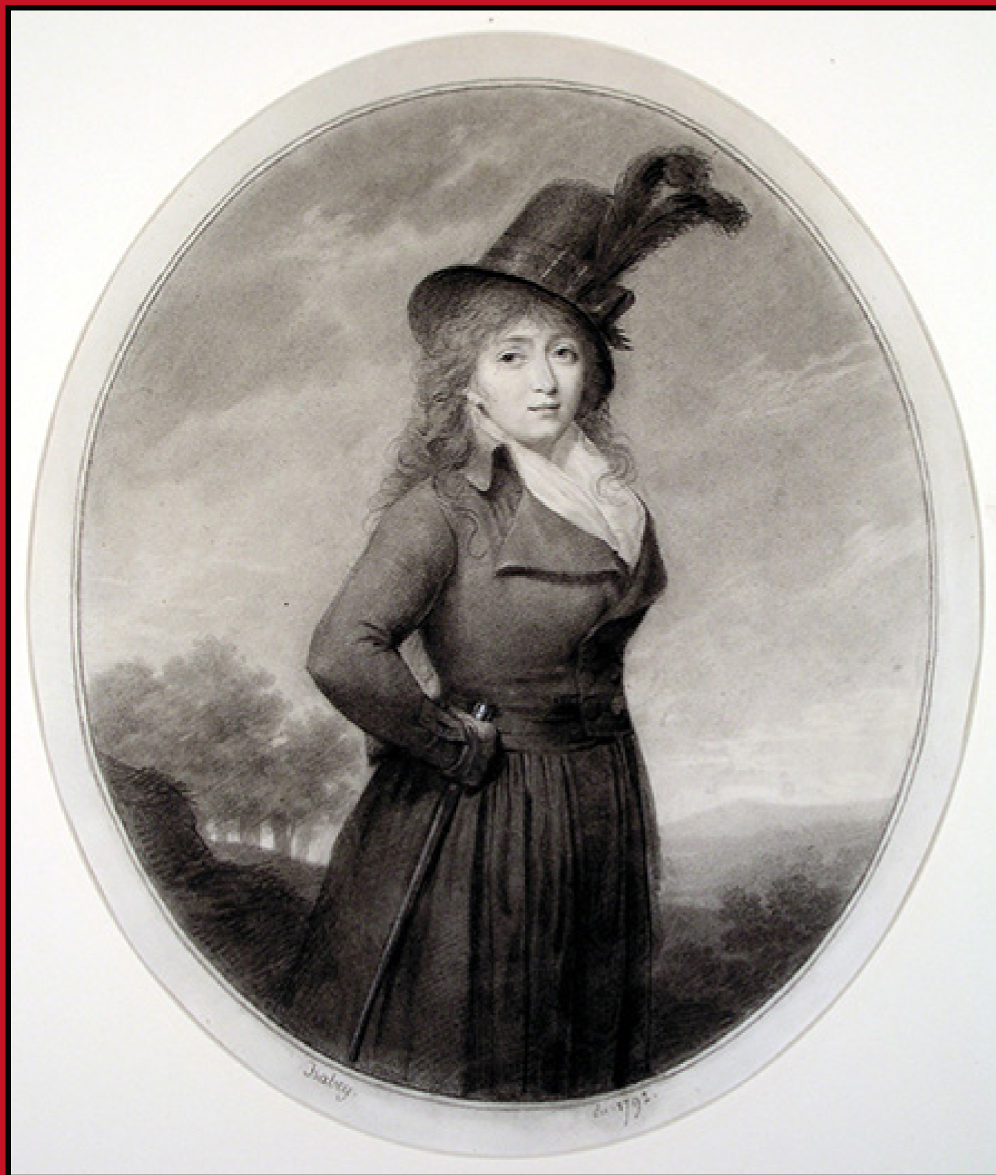
Jean-Baptiste Isabey (French, 1767–1855) Woman in a Riding Habit , 1792 Black chalk heightened with white on paper (73.12)