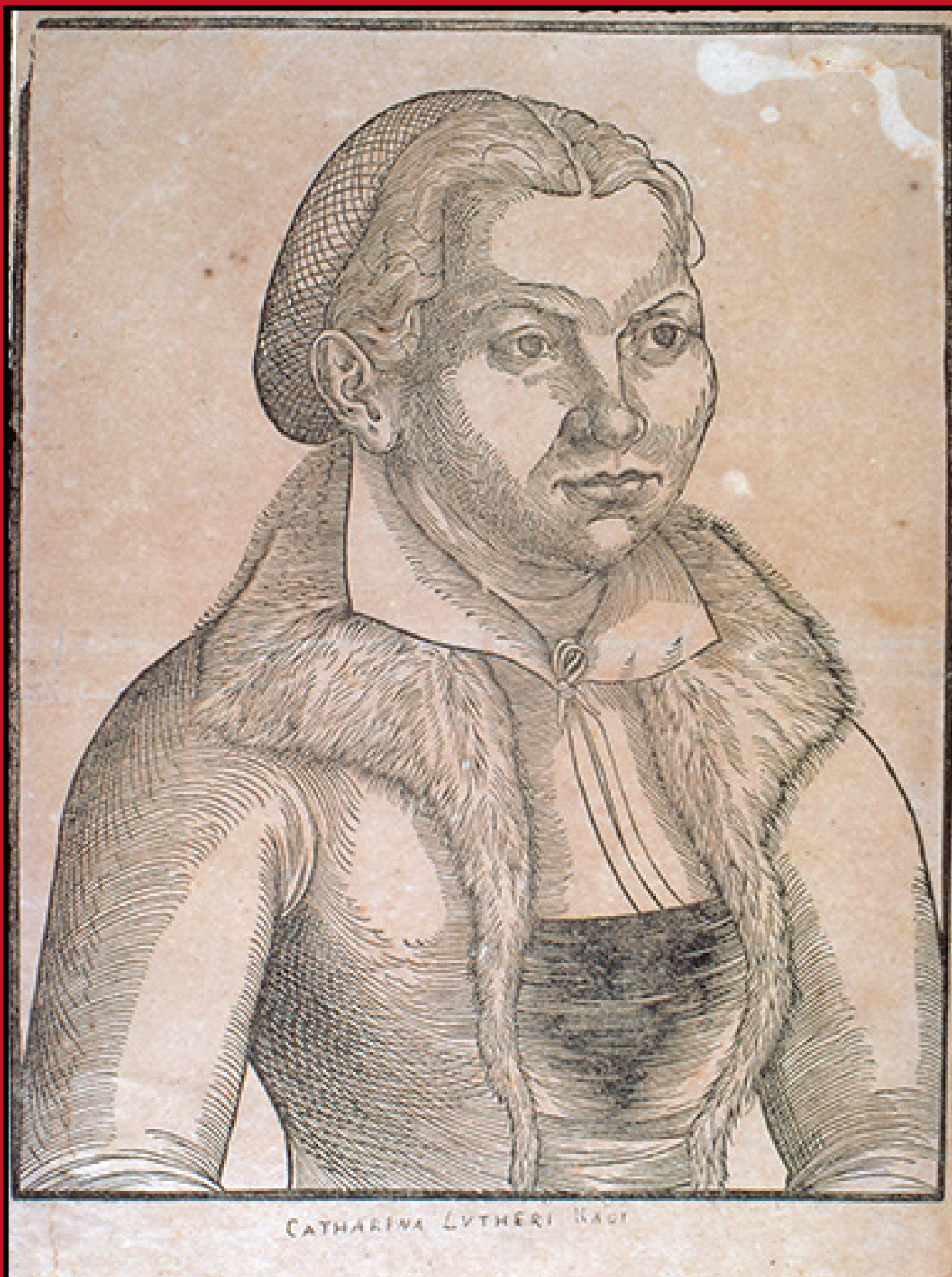
Hans Brosamer (German, ca. 1500–1552) Katharina von Bora Luther , ca. 1520–1552 Woodcut on paper (71.116)

Hans Brosamer was a Renaissance painter and printmaker, working largely in Germany. His woodcut is based on an earlier painting of Katharina von Bora Luther by artist Lucas Cranach the Elder (1472–1553), a personal friend of both the subject and her husband, theologian Martin Luther.