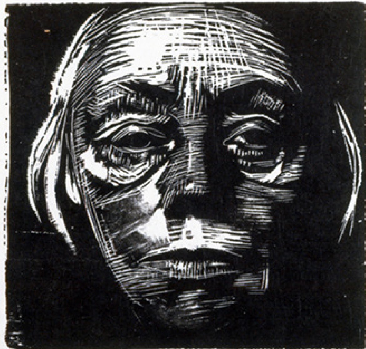
Käthe Kollwitz (German, 1867-1945) Selbstbildnis von vorn (self-portrait from the front), 1923 Woodcut on Japan paper Gilbreath-McLorn Museum Fund (90.126)