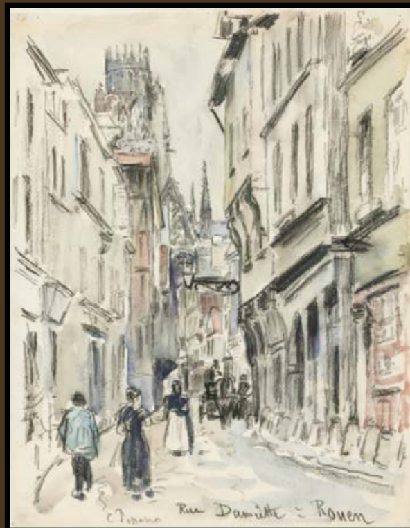
Camille Pissarro Rue Damiette, Rouen , ca. 1884 Crayon and watercolor on paper Cleveland Museum of Art (1968.357)