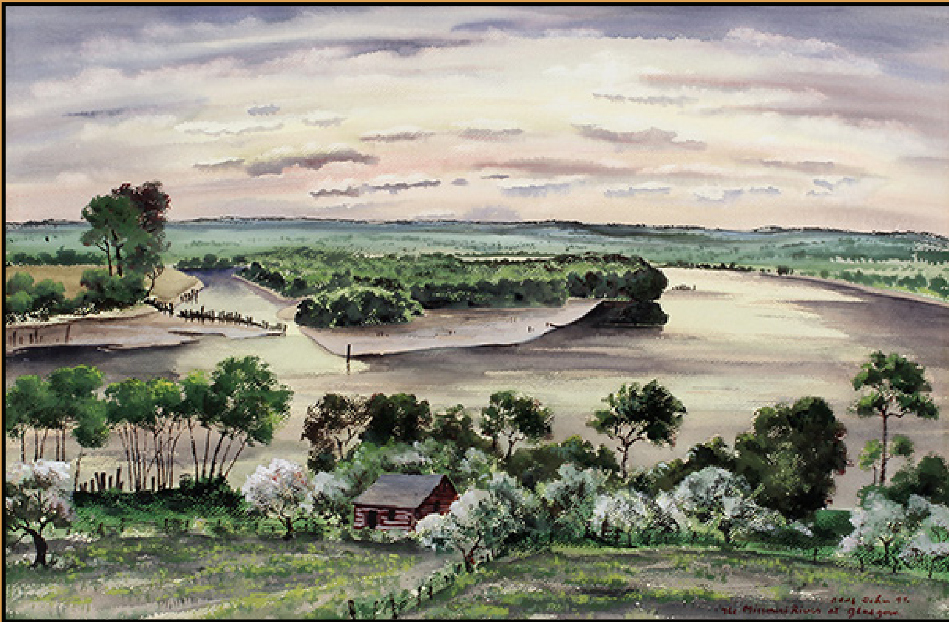
Adolf Dehn (American, 1895–1968) The Missouri River at Glasgow , 1947