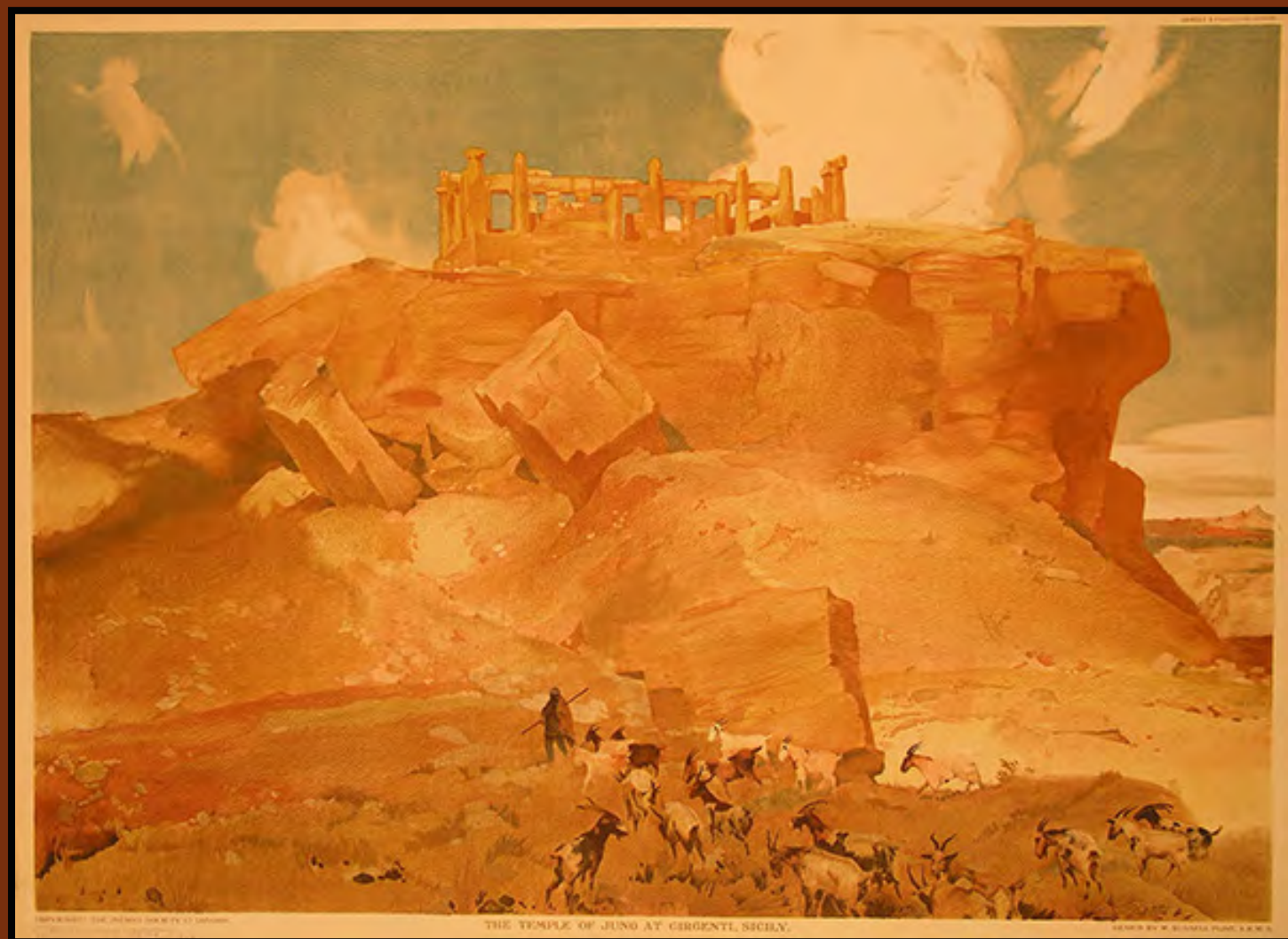
Sir William Russell Flint (Scottish, 1880–1969) The Temple of Juno at Girgenti, Sicily , ca. 1918 Color lithograph Museum purchase (2005.4)

The son of watercolorist Francis Wighton Flint, William Russell Flint had a long and distinguished career as a painter and printmaker. After attending the Royal Institution School of Art in Edinburgh, Flint went to work for the Illustrated London News . He also continued to paint and became President of the Royal Society of Painters in Watercolour in 1936.