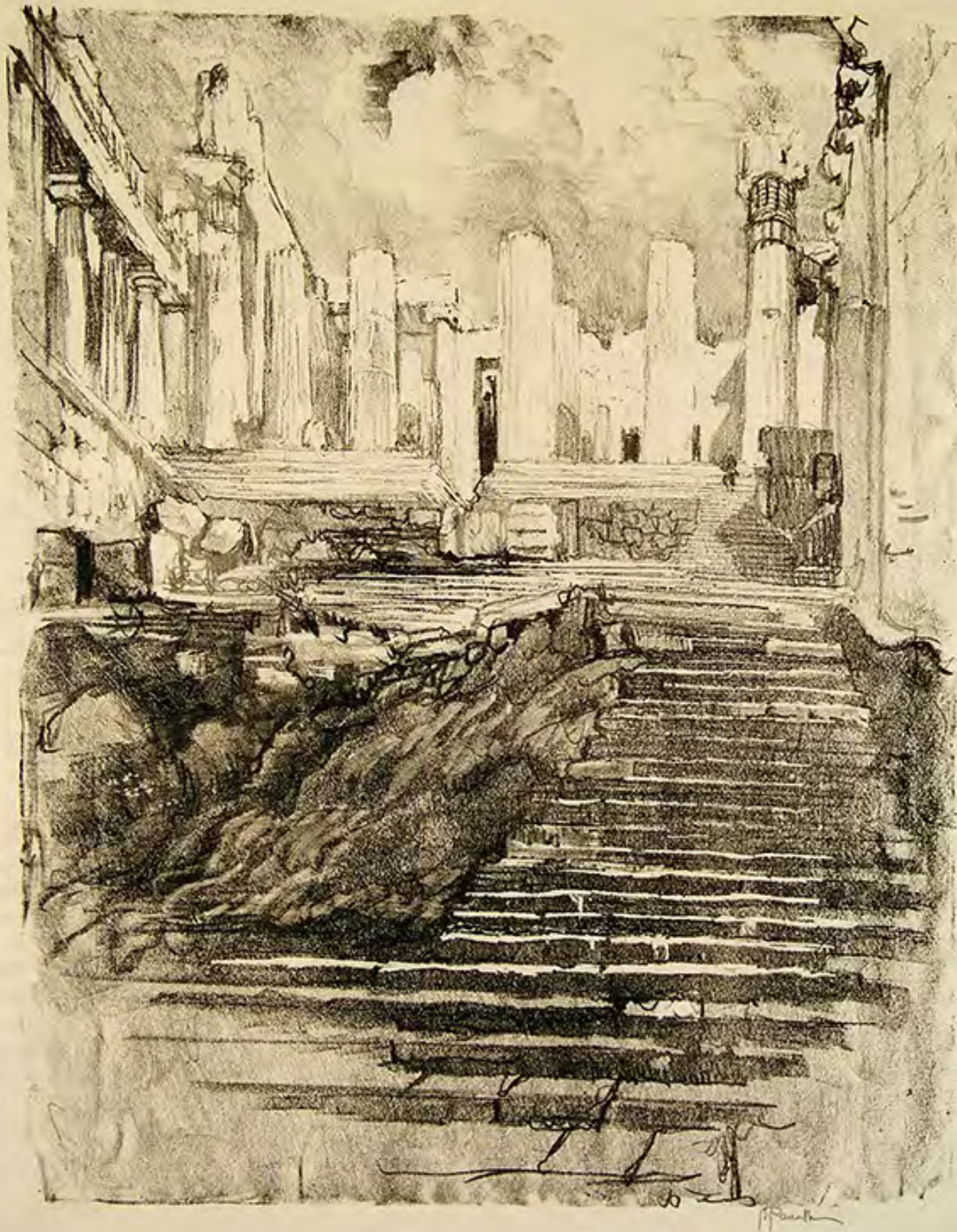
Joseph Pennell (American, 1857–1926) The Way Up to the Acropolis , from his book In the Land of the Temples , 1913 Lithograph Museum purchase (2005.5)

Philadelphia-born Joseph Pennell attended the Pennsylvania Academy of Fine Arts but ultimately settled in London. Pennell illustrated primarily for English publications and lectured on the art of illustration. In 1908, he co-authored a biography of James McNeill Whistler, whom he greatly admired.